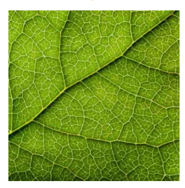
Our combined knowledge and experience allows us to provide advice, support and publicity to any public authority that wants to implement sustainable and innovation procurement.