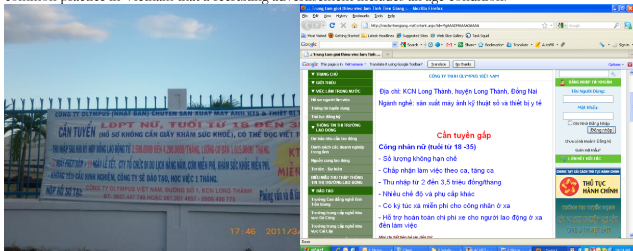
Hiring announcement posted at factory

Olympus' hiring policy targets women aged 18–35. Only hiring those under 35 constitutes age discrimination, even if age discrimination is not legally enforced. Olympus' response to this is that it is a common practice in Vietnam that a recruiting advertisement includes an age condition. 95