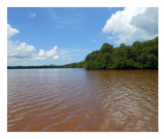
Water sampling at the water pocket close to the stockpile (Photo by FoE Japan, Oct. 2011)

FoE Japan has been monitoring in Rio Tuba continuously since 2006. They have focused on nickel mining operations by RTNMC and hydrometallurgical processing operations by CBNC. In January 2009, FoE Japan conducted interviews<sup>5</sup> with a total of 133 indigenous Palawan households. They documented Palawans' experiences of changes in the environment, their livelihoods and health since the start of CBNC operations. Considering the widespread presence of skin conditions, FoE Japan worked with water analysis experts from 2009 to 2011 to understand the extent of water contamination in the area. In the following eight years, they collected 74 water samples in key contaminated areas during the dry and wet seasons.