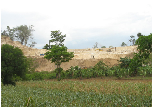
The sacred hill in 2010