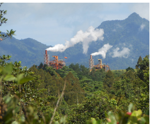
Inside Rio Tuba Nickel Mine Premises