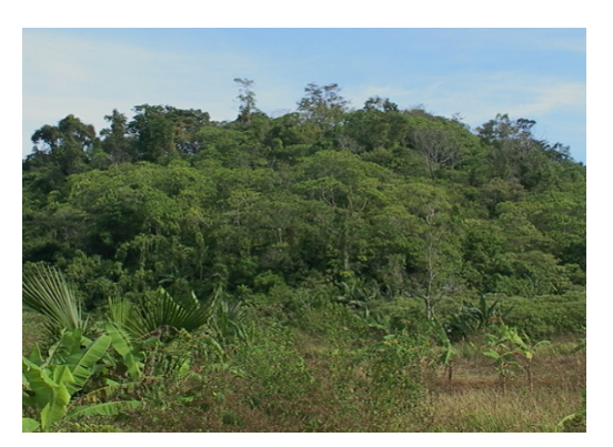
The sacred hill in 2002