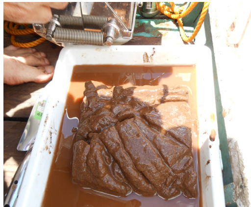
Test tube results from the location (Photo by FoE Japan, Oct. 2011)