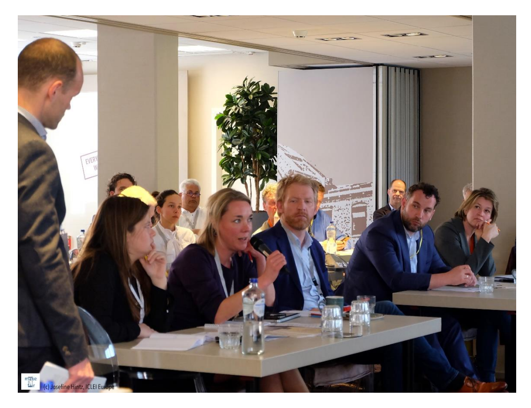
1 Haarlem presents its ambitions for socially responsible ICT to suppliers at the first 'Meet the Buyer' event

April 2019. The 40 participants – representing the municipality, suppliers, resellers as well as other interested public authorities – were introduced to the use of different types of criteria, specifications and clauses to ensure human rights and decent worker conditions, and to Haarlem's goals for social responsibility in procurement. A "pitch slam" gave companies the opportunity to present their strategies and accomplishments in social responsibility. This was followed by roundtable discussions focused around how suppliers and resellers can work together on social criteria used in tenders, and improvements of supply chain transparency. It became clear to the procurement team that local suppliers were able to deliver on the social criteria Haarlem planned to include in the upcoming procurement. In addition, the engagement initiated a debate on how to enable social criteria in a "hardware-as-a-service" model.