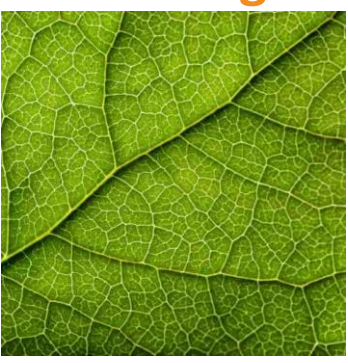
Our combined knowledge and experience allows us to provide advice, support and publicity to any public authority that wants to implement sustainable and innovation procurement.