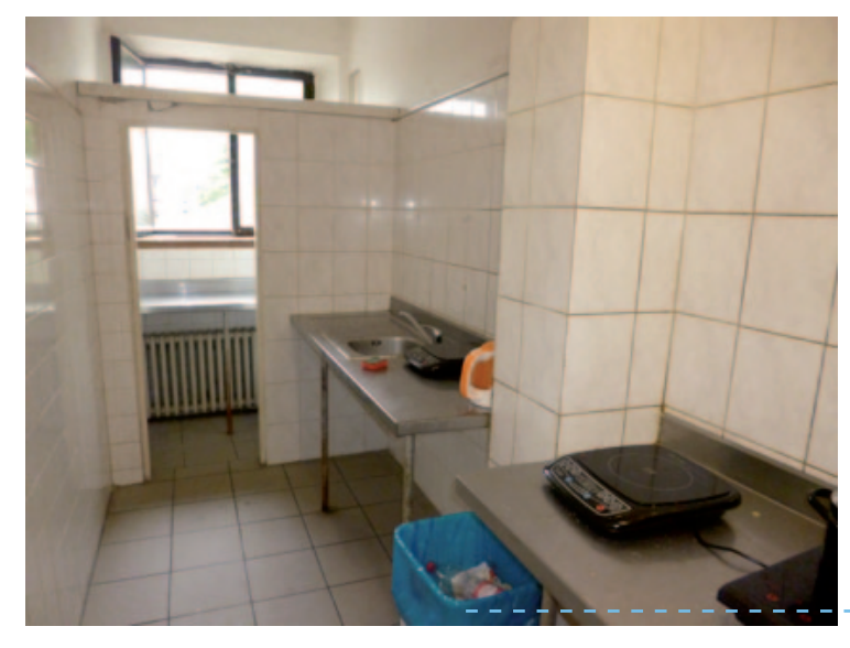
The kitchen at the Veselka dormitory contains only a few hot plates.

According to Electronics Watch researchers' observations and worker testimonies, Veselka, along with the Hůrka dormitory, is one of the dormitories with the lowest hygiene standards. It is in a neglected state though some repairs have taken place since the beginning of this research. Its advantage is its location in the centre of Pardubice with shops and other services within walking distance. Veselka mainly accommodates core workers from Mongolia, with a small number of Romanian indirect workers.