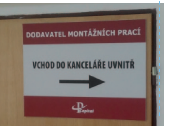
Figure 1. Sign at entrance to the office of Foxconn´s subcontractor, Profi Capital, reads, "Supplier of Assembly Work."

Other reports have described similar challenges of addressing Similar challenges issues were described in the Hungarian electronics sector: Perényi, Zsófia, Rácz, Kristóf and Irene Schipper, The flex syndrome: Working conditions in the Hungarian electronics sector, Amsterdam: SOMO, 2012. The authors claim that the work hour accounts are in contravention with the ILO standards (ILO convention 1, art.2, C).