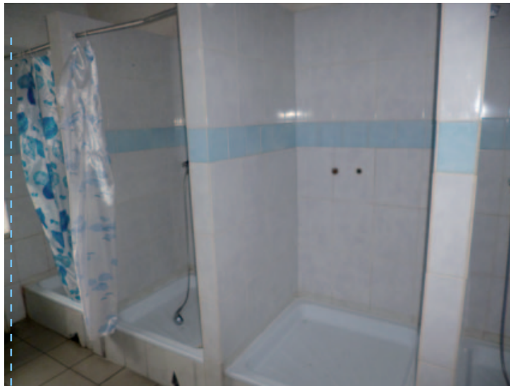
Several showers at the Veselka dormitory were out of order in the summer of 2016.

According to Electronics Watch researchers' observations and worker testimonies, Veselka, along with the Hůrka dormitory, is one of the dormitories with the lowest hygiene standards. It is in a neglected state though some repairs have taken place since the beginning of this research. Its advantage is its location in the centre of Pardubice with shops and other services within walking distance. Veselka mainly accommodates core workers from Mongolia, with a small number of Romanian indirect workers.