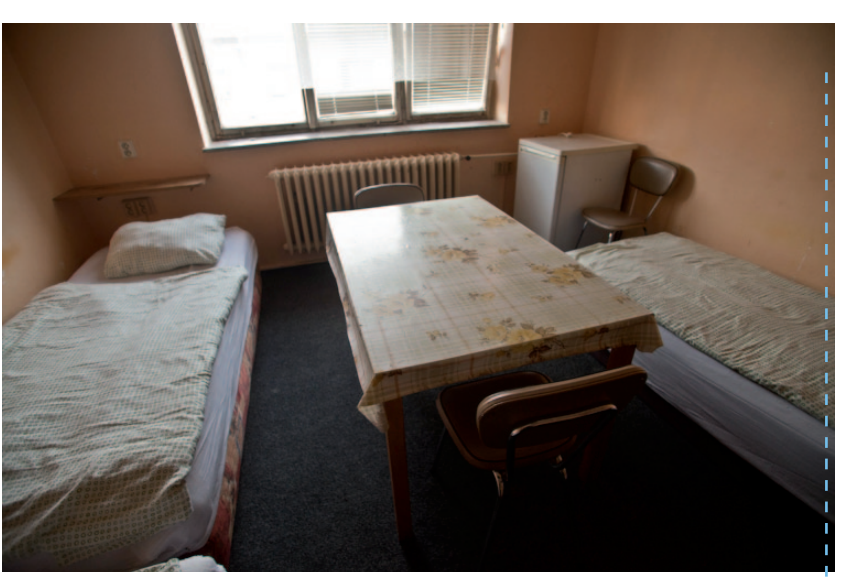
Veselka dormitory bedroom.