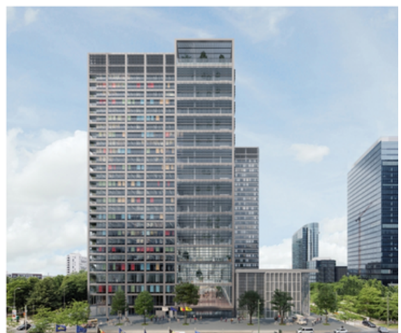
One of the buildings which the Agency for Facility Operations is refurbishing to become a circular, sustainable building

An affiliation with Electronics Watch is valuable for all organisations. It doesn't matter if you are very experienced or just taking the first steps, Electronics Watch will boost your progress.