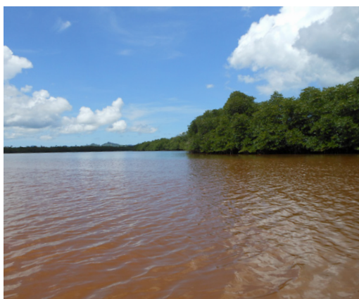
Water sampling at the water pocket close to the stockpile

FoE Japan has been monitoring in Rio Tuba continuously since 2006. They have focused on nickel mining operations by RTNMC and hydrometallurgical processing operations by CBNC. In January 2009, FoE Japan conducted interviews 5 with a total of 133 indigenous Palawan households. They documented Palawans' experiences of changes in the environment, their livelihoods and health since the start of CBNC operations. Considering the widespread presence of skin conditions, FoE Japan worked with water analysis experts from 2009 to 2011 to understand the extent of water contamination in the area. In the following eight years, they collected 74 water samples in key contaminated areas during the dry and wet seasons.