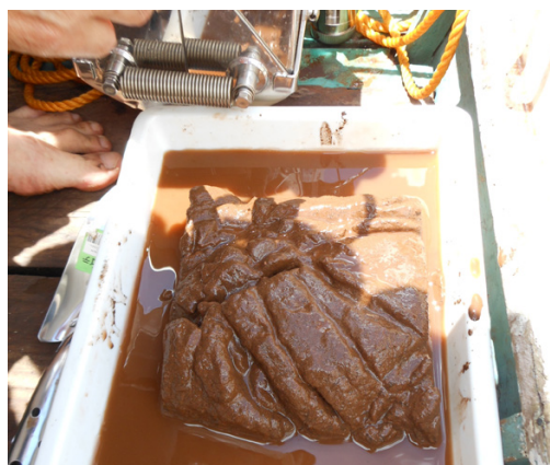
Test tube results from the location