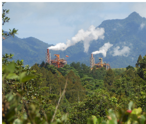
Plant I and II of Coral Bay Nickel Corporation

Palawan is known for its diverse and endemic flora and fauna. Many of the endemic species are also considered rare, threatened or endangered. Nickel mining has caused environmental destruction and led to peoples' struggles against the expansion of mines. The Strategic Environmental Plan for Palawan Act (SEP law/ Republic Act No. 7611 of 1992) 3 protects the natural habitat and the resources.