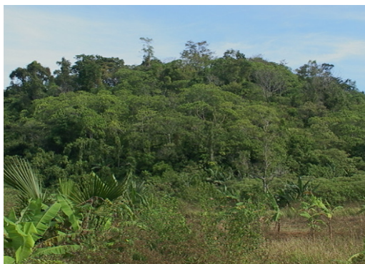
The sacred hill in 2002