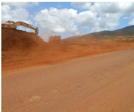
Inside Rio Tuba Nickel Mine Premises