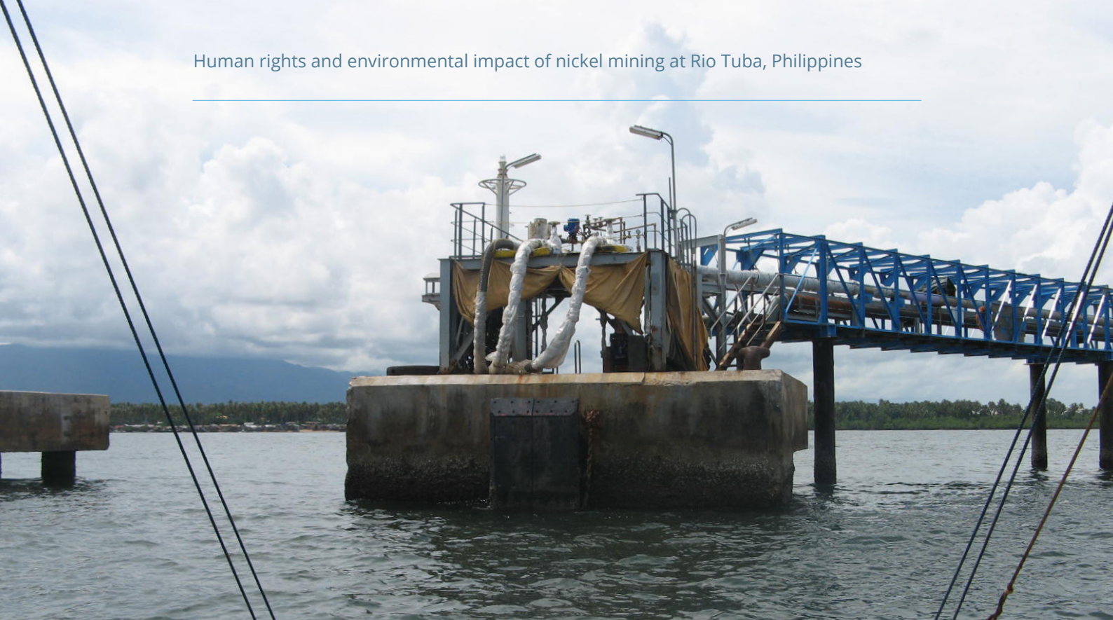
Pipeline carrying water from CBNC tailings facility to the sea near Tagdalongon