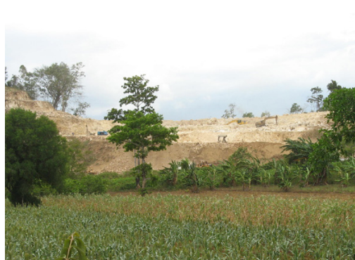
The sacred hill in 2010