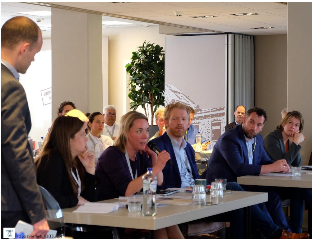
1 Haarlem presents its ambitions for socially responsible ICT to suppliers at the first ‘Meet the Buyer’ event

April 2019. The 40 participants – representing the municipality, suppliers, resellers as well as other interested public authorities – were introduced to the use of different types of criteria, specifications and clauses to ensure human rights and decent worker conditions, and to Haarlem’s goals for social responsibility in procurement. A “pitch slam” gave companies the opportunity to present their strategies and accomplishments in social responsibility. This was followed by roundtable discussions focused around how suppliers and resellers can work together on social criteria used in tenders, and improvements of supply chain transparency. It became clear to the procurement team that local suppliers were able to deliver on the social criteria Haarlem planned to include in the upcoming procurement. In addition, the engagement initiated a debate on how to enable social criteria in a “hardware-as-a-service” model.